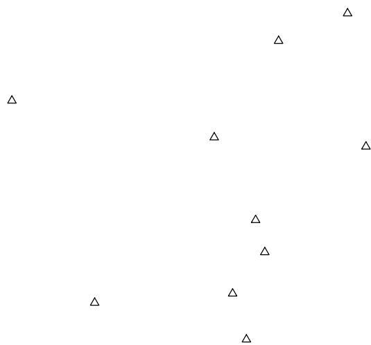
Figure 1: plot of SpatialPoints object; aspect ratio of x and y axis units is 1